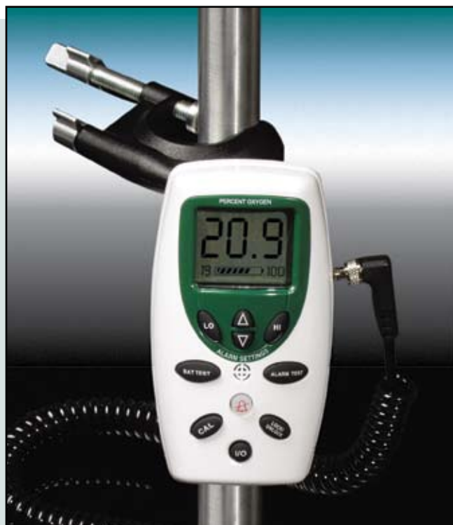
Easily secures to poles and shelves